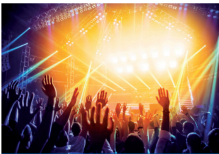
Stage and Entertainment lighting