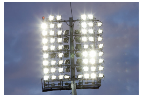
Stadium / Street Road lighting