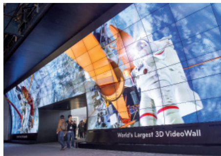
LED Walls and Video Displays (indoor and outdoor)