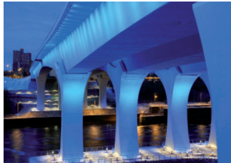
Bridge / Road Infrastructure lighting