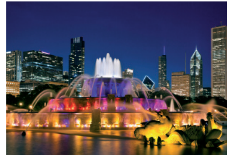
Water and Wet Design (Fountains, Pools and Waterparks)