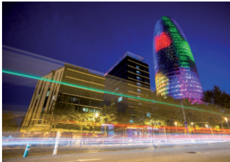
Architectural lighting (Graze & Cove)

SOURIAU is a leading provider of interconnect solutions designed to meet UL and international LED and luminaire safety standards. We are a unique company that offers flexibility, a collaborative approach and a strong commitment to meeting our customers design, engineering and manufacturing needs when bringing new products to market. For these reasons, SOURIAU has been the chosen interconnect provider for a variety of customers leading the market with innovative lighting products servicing a diversity of applications.